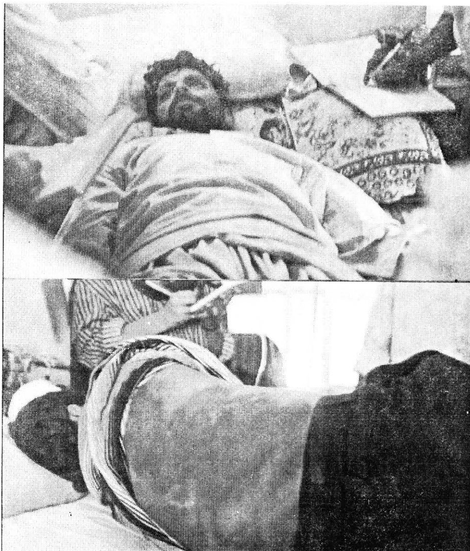
Tortured victims in Soura hospital, Srinagar