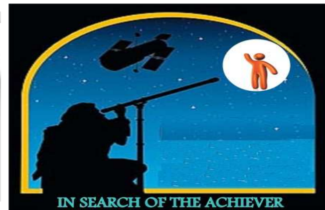
IN SEARCH OF THE ACHIEVER

DEPARTMENT OF COMMERCE AND RESEARCH CENTRE University Of Pune