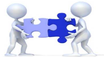
SOLVE IT YOUR WAY