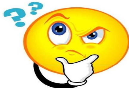
WHAT IS THE RIGHT JARGON?