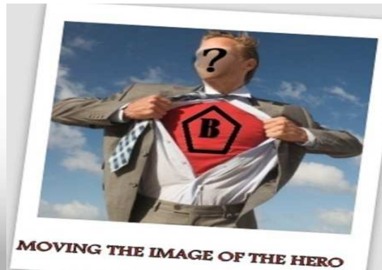
MOVING THE IMAGE OF THE HERO