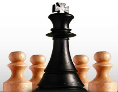
Leader! Leader!! Lead me!!!